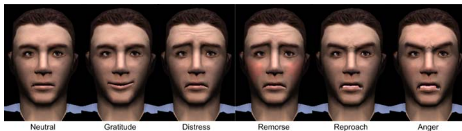
Fig. 1. The facial expressions used for the moral virtual human condition. Usual facial configurations are used for gratitude, distress, remorse, reproach and anger. Typical wrinkle patterns are used for distress, remorse, reproach and anger. Blushing of the cheeks is used for remorse and (light) redness of the face is used in anger.

Virtual Humans. The virtual human platform we use supports expression of emotions through gesture, face and voice [12]. The focus on this work, however, is on expression of moral emotions through the face. Facial expression relies on a pseudo-muscular model of the face and on simulation of wrinkles and blushing. The facial expressions for the moral virtual human condition are shown in Fig.1. These expressions are elicited after the subject chooses its action and the outcome of the round is shown. The neutral condition uses the neutral face. Aside from facial expression, Perlin noise to the neck and torso and blinking was added to both conditions to keep the virtual human from looking stiff while the subject is choosing its actions. Finally, a different shirt (i.e., texture) is chosen to help distinguish the two virtual humans the subject plays with. Shirts vary according to letter (A or B) and color (blue or yellow). The letter 'A' is always assigned to the first player and the letter 'B' to the second. The shirt colors are assigned randomly to each player. Neutral images of the respective virtual humans, with the respective shirts, are also shown in the debriefing questions to help subjects remember the players.