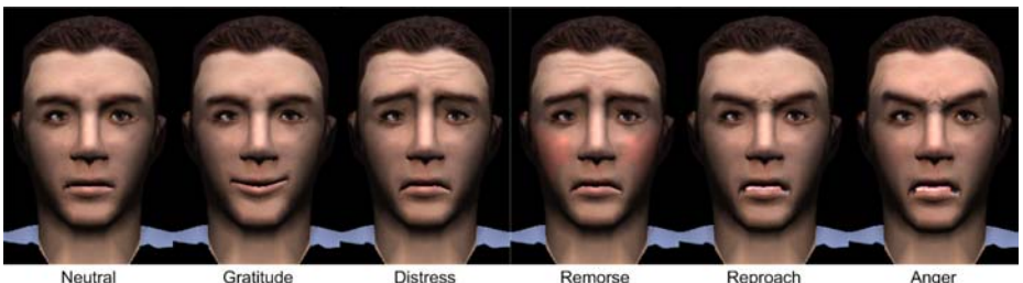
Fig. 1. The facial expressions used for the moral virtual human condition. Usual facial configurations are used for gratitude, distress, remorse, reproach and anger. Typical wrinkle patterns are used for distress, remorse, reproach and anger. Blushing of the cheeks is used for remorse and (light) redness of the face is used in anger.

Virtual Humans. The virtual human platform we use supports expression of emotions through gesture, face and voice [12]. The focus on this work, however, is on expression of moral emotions through the face. Facial expression relies on a pseudomuscular model of the face and on simulation of wrinkles and blushing. The facial expressions for the moral virtual human condition are shown in Fig.1. These expressions are elicited after the subject chooses its action and the outcome of the round is shown. The neutral condition uses the neutral face. Aside from facial expression, Perlin noise to the neck and torso and blinking was added to both conditions to keep the virtual human from looking stiff while the subject is choosing its actions. Finally, a different shirt (i.e., texture) is chosen to help distinguish the two virtual humans the subject plays with. Shirts vary according to letter (A or B) and color (blue or yellow). The letter 'A' is always assigned to the first player and the letter 'B' to the second. The shirt colors are assigned randomly to each player. Neutral images of the respective virtual humans, with the respective shirts, are also shown in the debriefing questions to help subjects remember the players.