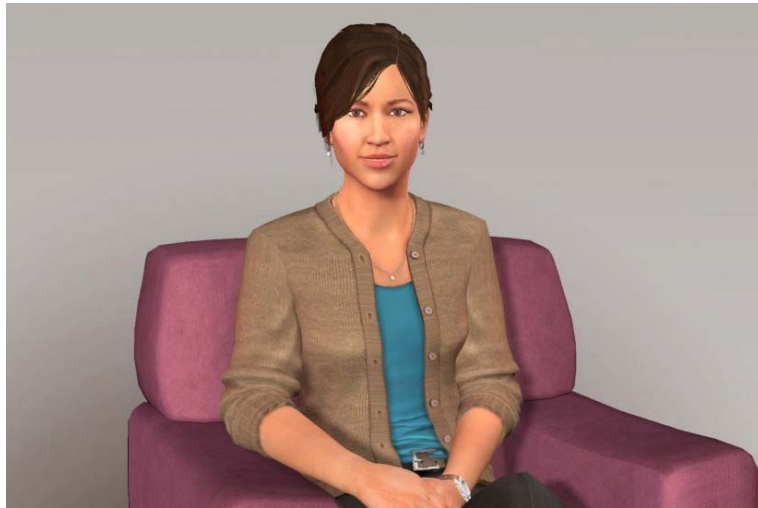
Fig. 2. People are more willing to self-disclose honestly with virtual than real healthcare professionals.

In this subsection, we present three interaction contexts that seem to inherently favor machines to humans. First, we consider self-disclosure in health-screening interviews. In these clinical settings, it is important that patients disclose information about themselves honestly so that healthcare professionals may get an accurate medical history. In a recent study, Lucas et al. [42] demonstrated that when people believed that a virtual doctor was being controlled by algorithms, versus being driven by an actual person, people reported lower fear of self-disclosure, lower impression management, and were rated by observers as being more willing to disclose truthfully (Fig. 2).